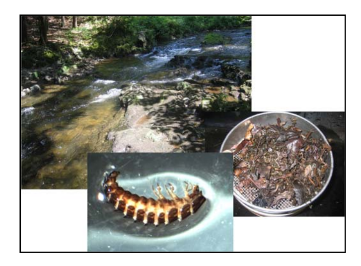
This image shows a stream environment in upstate New York where we have tested this experiment, a sieve with leaves from a leaf pack, and a macroinvertebrate.