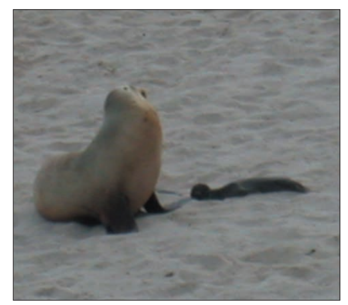
Figure 3. Sea lion with aborted pup. The probable cause was beta herpes virus.

Not only is spread rate in the ocean rarely measured, information on the modes of marine disease transmission is also lacking. Many terrestrial epidemics propagate via flying insect vectors, but vectored transmission in the ocean is poorly documented. One of the few known examples is a coral predator, the fireworm, that transmits Vibrio shiloi , the bacterium responsible for infectious coral bleaching (Figure 6; Sussman et al. 2003). Long-range dispersal of some marine parasites with complex life cycles occurs where migratory sea birds are the definitive hosts. Pathogen interchange between terrestrial and marine environments seems to be predominantly from land to ocean (usually via rivers), although little is known about the actual rates of pathogen exchange. For example, the