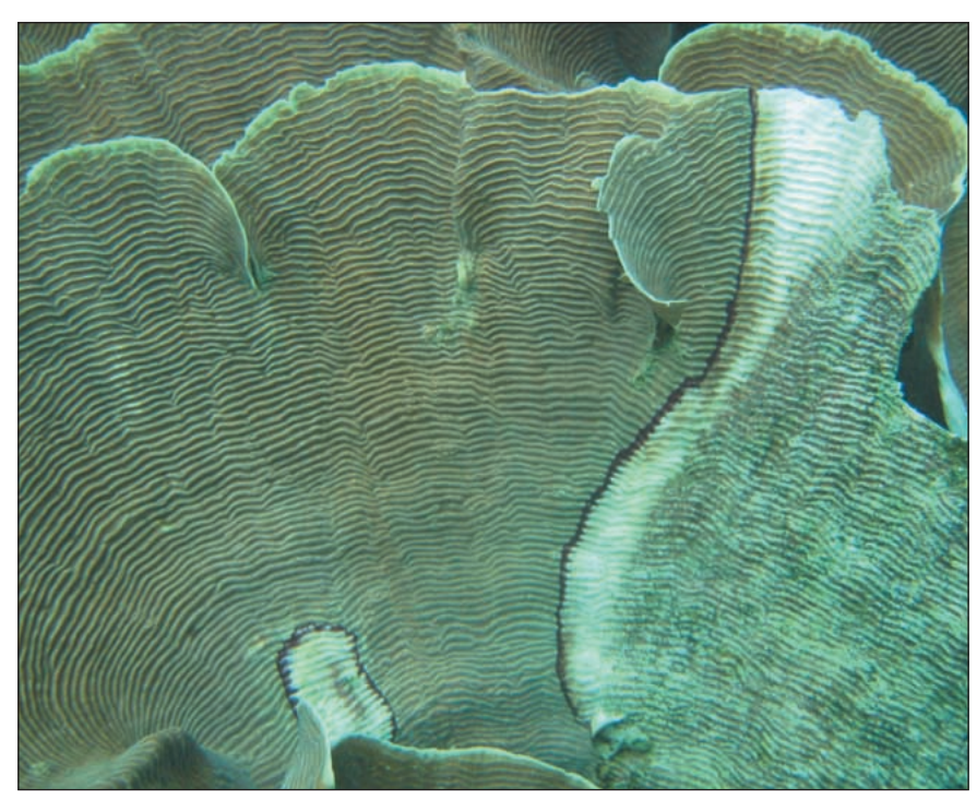
Figure 5. Recently detected coral diseases: Palauan Pachyceris infected with unknown red band infection.

Of the 34 animal phyla, only nine occur on land (Schubel and Butman 2000), making the potential for diverse host–parasite interactions in marine environments greater than in terrestrial ones. In addition to the greater diversity of host phyla, more classes of organisms are involved in parasitic relationships in marine environments (McCallum et al. unpublished) and hosts in the ocean include groups such as coral that have no terrestrial counterpart. Among animals, modular, clonal life forms, like corals and sponges are more common in marine environments. As hosts, modular and other clonal species may permit a build-up of more virulent disease strains, because their genetic homogeneity, coupled with the rel-