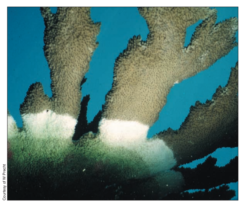
Figure 1. Caribbean elkhorn coral (Acropora palmate) infected with white band disease.

are expected to increase. Each of these activities has the potential to substantially accelerate the transmission rate of new pathogens and some will also make the hosts more susceptible.