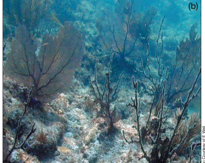
Figure 2. (a) Caribbean seafans (Gorgonia ventalina) infected with Aspergillus and (b) Sea fan skeletons killed by aspergillosis.

shrimp and spread to the Americas from Asia in 1995 (Jory and Dixon 1999); and Taura syndrome virus of white shrimp ( Penaeus vannamei ), which began to spread to North America from Ecuador in 1992 (Overstreet et al. 1999). There are currently no accurate estimates of the magnitude of the spillover problem for other possible pathogens, but aquaculture is a likely source of new pathogens entering wild populations in the ocean.