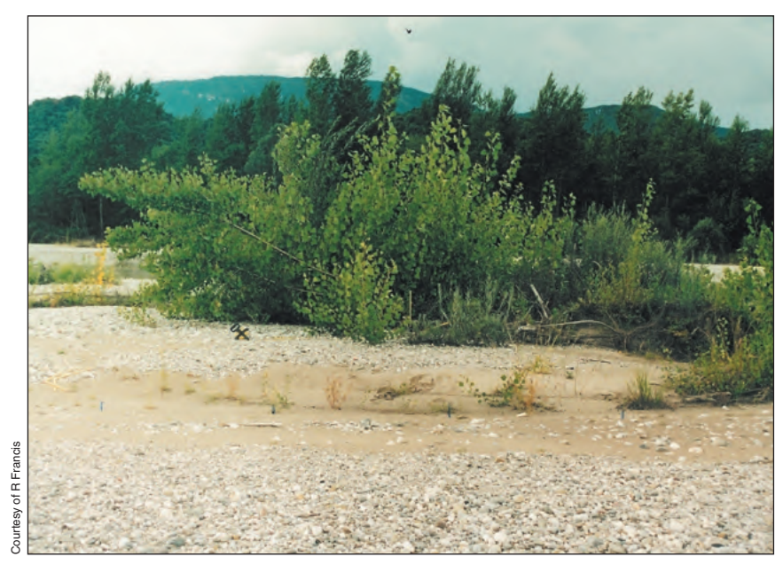
Figure 2. Early regrowth of poplar (Populus nigra) from a tree deposited by floodwaters along the Tagliamento in the second growing season, showing over 2m of growth.

Trees transported by floods become snagged on river bars, typically with their root bole oriented upstream. The hydraulic impact of an individual tree creates a set of closely linked topographic habitats (Figure 3a) on what