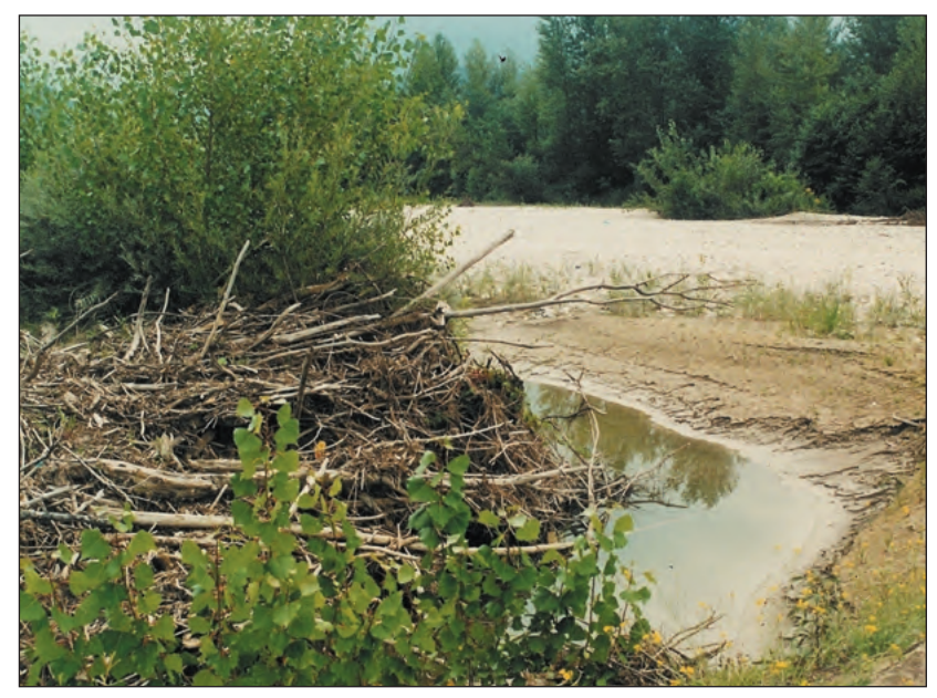
Figure 5. A well-established pioneer island with a large wood debris jam trapped against its upstream face and an adjacent scour hole that contains an ephemeral pond. The scour hole is bordered by fine sediment deposited by receding floodwaters and also by wind that has redistributed sand from the surrounding bar surface.

On the Tagliamento, ponds associated with islands pro-