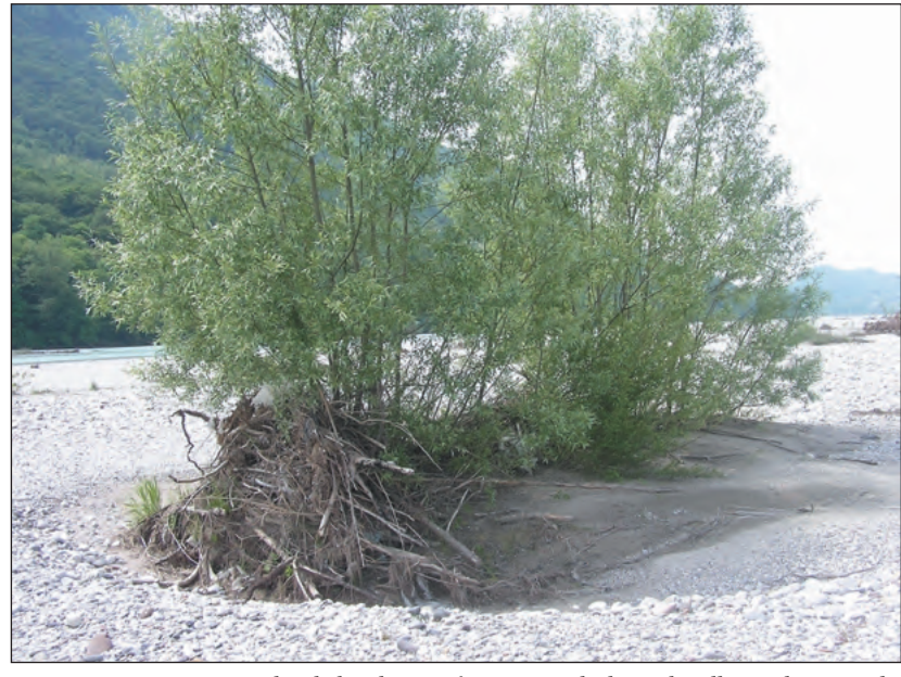
Figure 4. A pioneer island developing from a single buried willow, showing the features described in Figure 3b with wood debris accumulating around the root bole, gravel scour around the growing debris jam, and fine sediment deposition downstream.