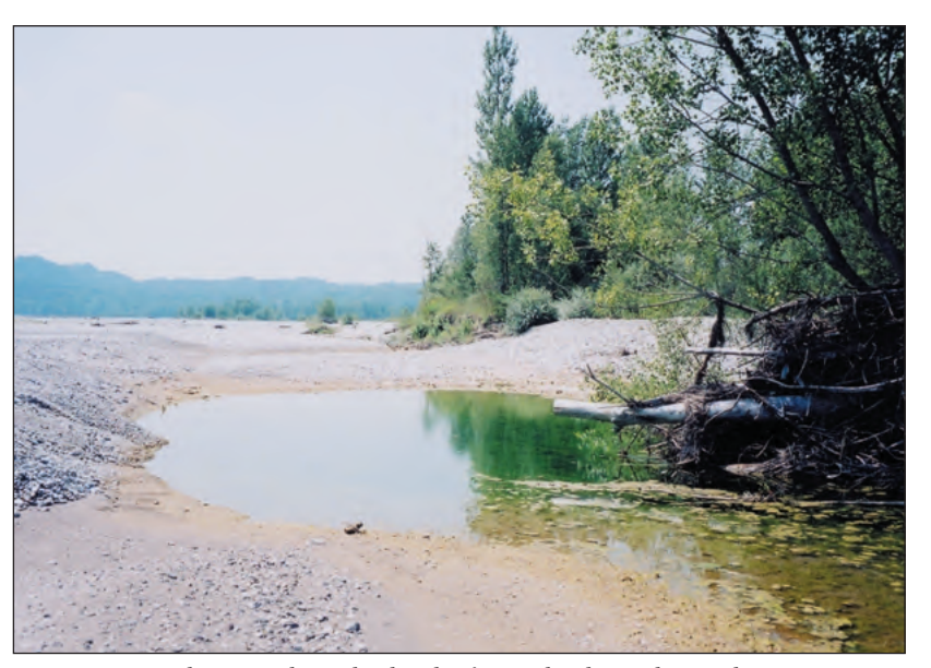
Figure 6. A deep pond at the head of an island on the Tagliamento River, showing a massive wood jam. The islands form a complex patch within an extensive expanse of bare gravel (view looking downstream).

We contend that island-braided rivers, although rare today, would have been a common style of gravel-bed river before the introduction of river engineering and flow regulation for water supply, flood control, hydroelectric power production, and navigation. Historical records support this contention for Europe (Gurnell and Petts 2002; Tockner et al. 2003) and North America (Maser and Sedell 1984), and research on impacts of dams has illus-