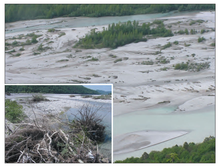
Figure 1. An island-braided section of the Tagliamento River, Italy. Pioneer islands surround the established island, with newly deposited trees draped across the bar adjacent to the main channel (foreground). The inset shows trees deposited across an expanse of bare gravel by a recent flood.

developed a model of island formation downstream from an initial deposited tree or wood jam at the head of a midchannel bar and eventual integration of the island into the floodplain. This island development model was driven by the accumulation of dead wood and the growth of vegetation from propagules deposited in the protected lee of the wood. In such locations, the wood supports vegetation growth by acting as a "resource node" (Pettit and Naiman 2005), where fine sediments accumulate, retaining moisture and nutrients from the decomposing plant material. From